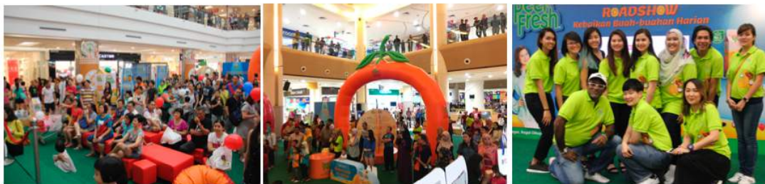
Marigold Peel Fresh Nationwide Roadshow