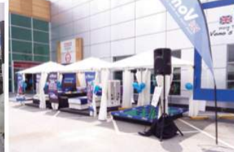
VONO Blue Truck Launch & Roadshow