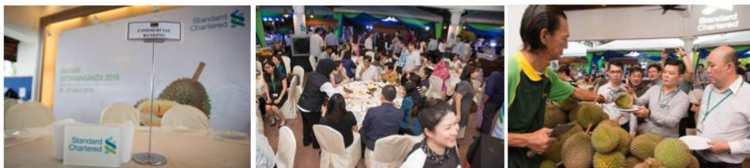
Standard Chartered Durian Party 2016