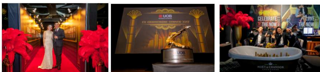
UOB Champion Dinner 2016