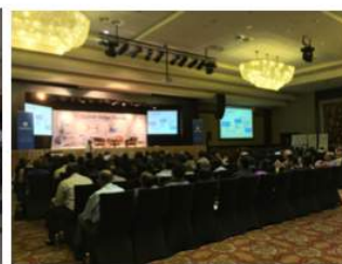
Zurich Edge Fund Seminar Nationwide