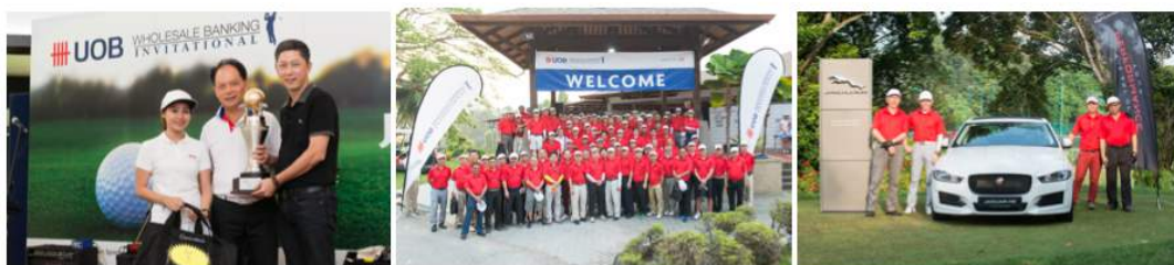
UOB Wholesale Banking Invitational Golf Tournament