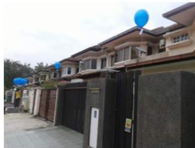
VONO Blue Truck Pre- Activation Balloon Distribution