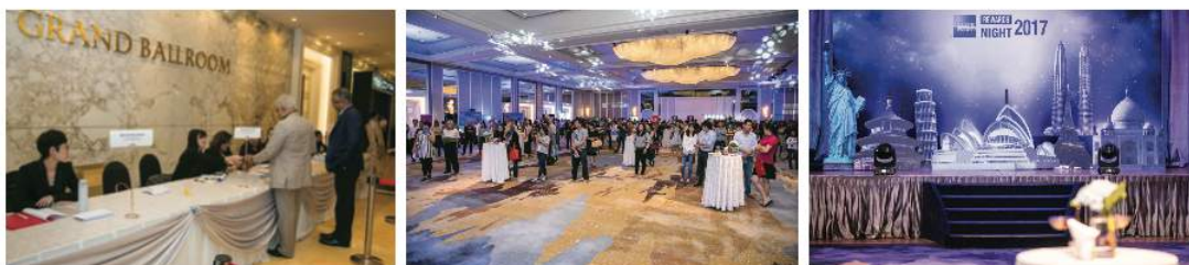
Maybank American Express Rewards Night