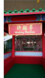
Matrix D Tempat CNY Decor & Celebration