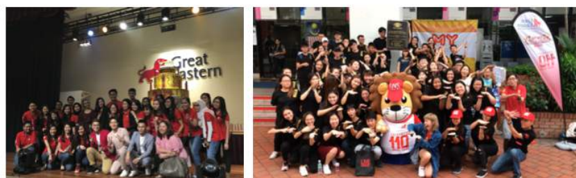
Great Eastern 110 Great Year On-ground Activation