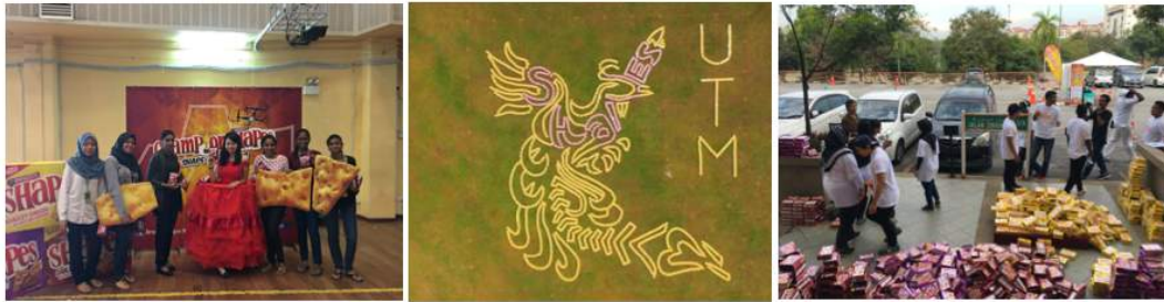
Arnott's Shape - ChampionShapes Inter-Campus Nationwide Contest 2016