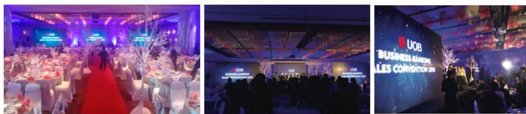
UOB Business Banking Sales Convention (Winter Theme)